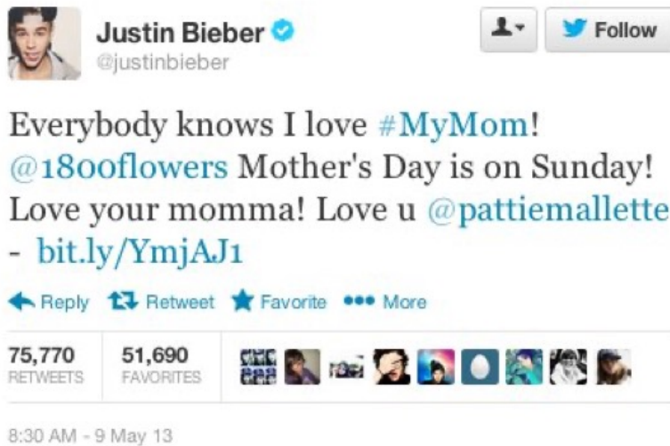
Sponsored tweet by Justin Bieber with no disclosure.

In addition to disclosure, endorsements can also raise falsity and substantiation issues about the endorser’s experience with the product – and endorsement claims without the endorser’s permission can raise § 43(a) false-endorsement and right of publicity issues.