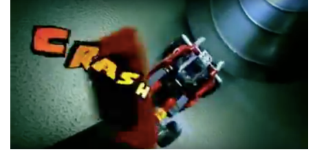
Still from challenged Lego Racers ad

The problem was that the combination of visuals and sound effects might “mislead children into believing that the toys were equipped with sound-effects equipment” and “create unrealistic performance expectations that children would not be able to duplicate.” For an adult audience, this would likely be non-actionable puffery, and even if it wasn’t, an on-screen disclaimer would likely suffice. But CARU believes that children will take commercials literally unless they are obviously fantasy (e.g. unrealistically animated rather than live-action), and also that disclaimers will often be ineffective. Lego agreed to drop the ad.