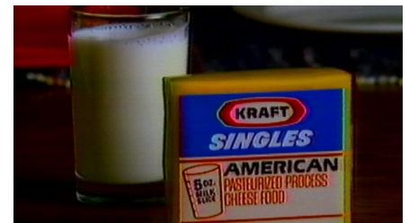
Still from Kraft Singles ad