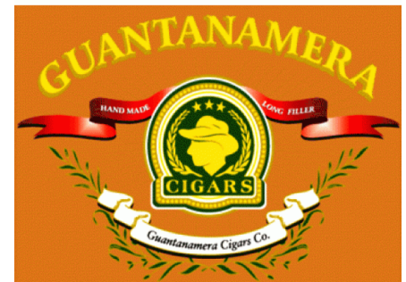
GCC’s GUANTANAMERA logo