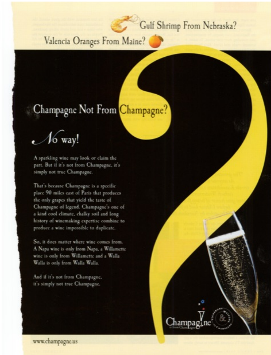
Ad placed in United States print media by the Comité Champagne