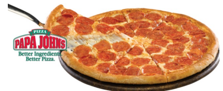
"Better Ingredients. Better Pizza" ad