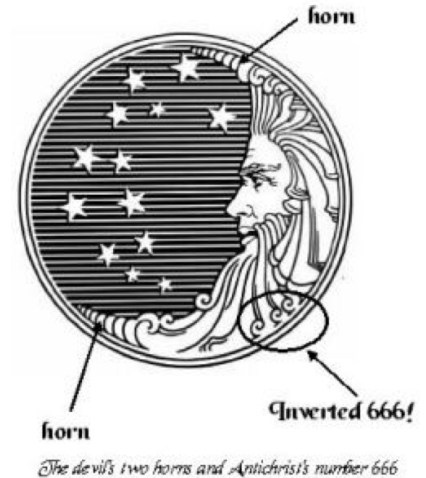
The allegedly Satanic P&G logo