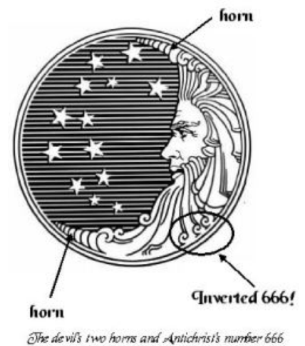
The allegedly Satanic P&G logo