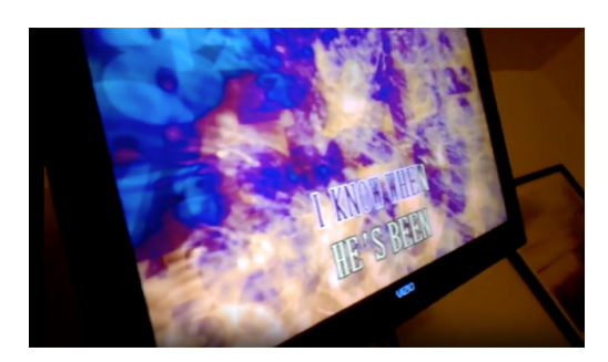
The Leadsinger lyrics display

indie folk-rock song over a montage at the end of an episode of a prestige TV drama, you need a synch license from the publisher. Same goes if you want to use a soulful Motown classic in a fast-food commercial. These licenses are typically individually negotiated, and depend heavily on the details of the use.