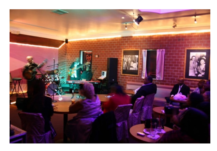
The Seabird [sic] Jazz Lounge