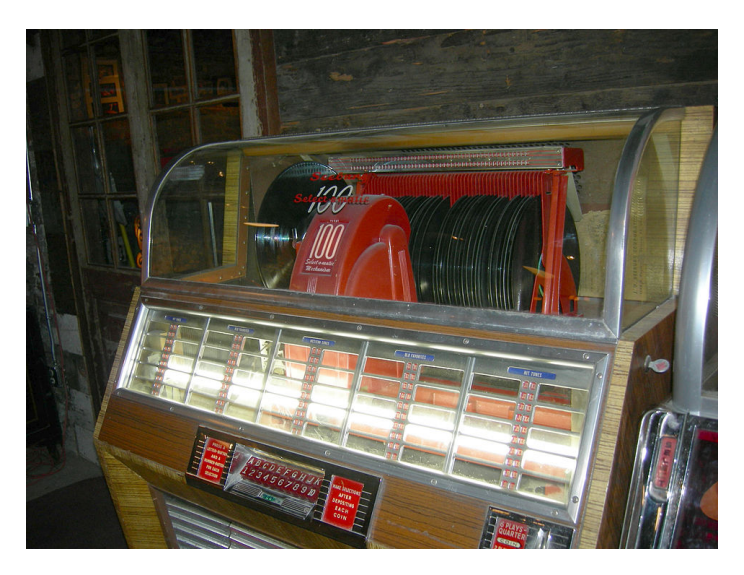
A jukebox. At the top are records; at the bottom are buttons to select which record to play.

just as it administers the statutory mechanical license. In 1989, however, the PROs negotiated a deal with the Amusement & Music Operators Association (AMOA), a jukebox trade association. They all went back to Congress, which blessed the deal, amended Section 116 to defer to privately neogiated licenses, and set up the Jukebox Licensing Organization to administer the newly negotiated jukebox license. Operators file paperwork with the JLO and pay a royalty based on how many jukeboxes they operate.