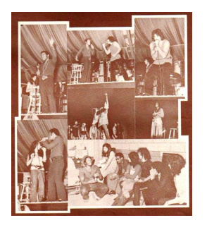
Jesus Christ Superstar (original Broadway production)