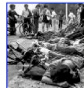
Victims of the Tiananmen 220 x 244 - 19k - jpg www.cbc.ca