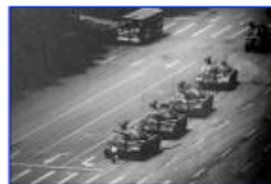
Wednesday, October 24, 2007 743 x 500 - 146k - jpg oneimagination.blogspot.com