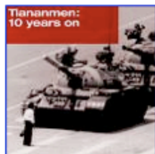
tiananmen 256 x 256 - 16k - gif www.guardian.co.uk