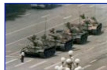
Young clerk lets Tiananmen ad slip 470 x 305 - 22k - jpg