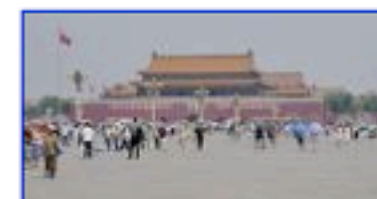
Tiananmen Square 720 x 369 - 76k - jpg www.galenfrysinger.com