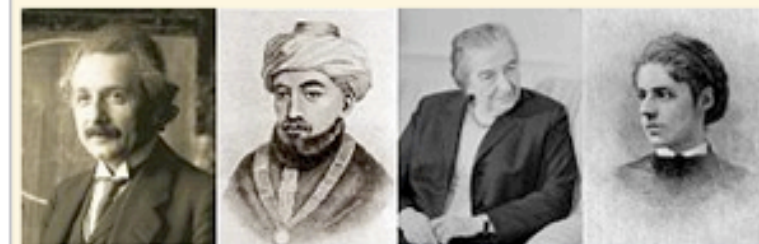
Albert Einstein • Maimonides • Golda Meir • Emma Lazarus