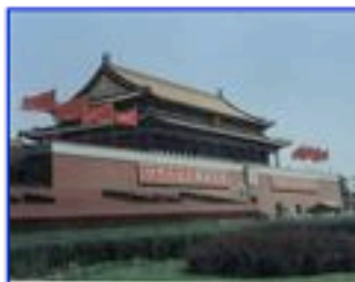
太湖拖船 - tiananmen.jpg

页】 300 x 250 - 18k - jpg www.cnetnews.com.cn