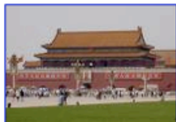
LPI大中华区办事处总部设在北京, 在

... 550 x 380 - 34k - jpg www.lpi-china.org