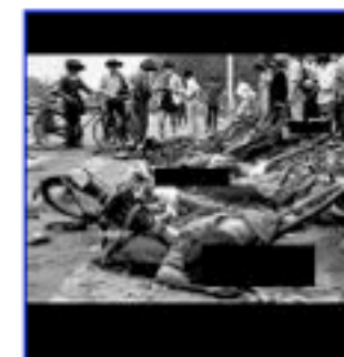
Tiananmen Square after 340 x 340 - 31k - jpg gaaagle.com