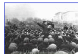
李铁华教授在沉思 (何家英绘) 1976 年4 ...

350 x 242 - 18k - jpg www.hebeishuhua.com