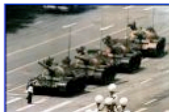
tiananmen-square-tanks.jpg 450 x 299 - 29k - jpg www.timboucher.com