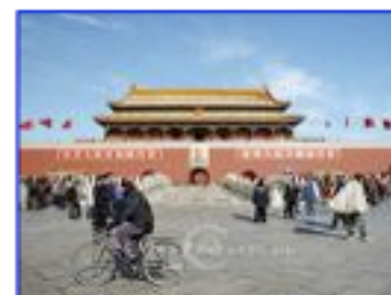
Tiananmen Tower 500 x 375 - 64k - jpg www.chinapictures.org