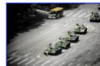
Tiananmen Square 500 x 323 - 36k - jpg