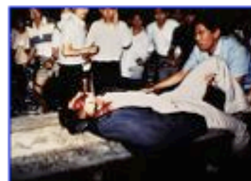
Tiananmen Square Photograph 527 x 376 - 43k - jpg