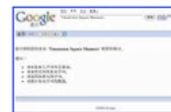
... searching for "Tiananmen" 649 x 376 - 36k - jpg brain-terminal.com