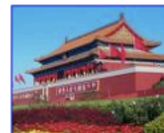
Tiananmen Square. 【返回新闻首

600 x 450 - 49k - jpg www.xysports.com.cn